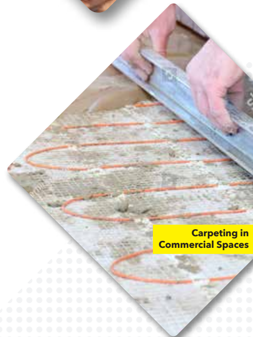
Carpeting in Commercial Spaces